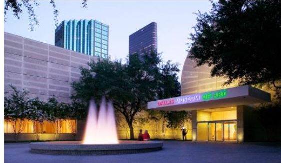
The Dallas Museum of Art