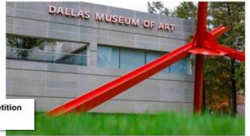
The Dallas Museum of Art announces Thursday a design competition for its campus in the Arts District. A first stage of massing is due March 16 from those wishing to be considered for the job.

The DMA will consider potential architects from around the world, museum officials for a project budgeted at $150 to $175 million.